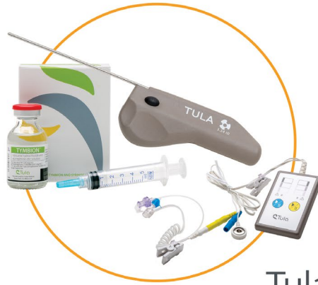
Tula ® Tympanostomy System